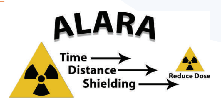
As Low As Reasonably Achieveable