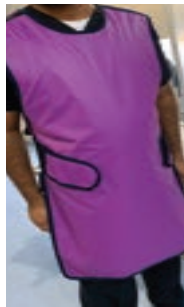
FOR DENTAL X-RAY